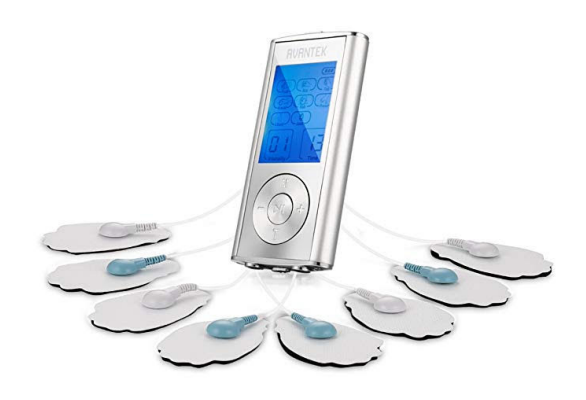
Future MyoStim ED ErectiStim portable device design