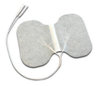
Electrode pad design