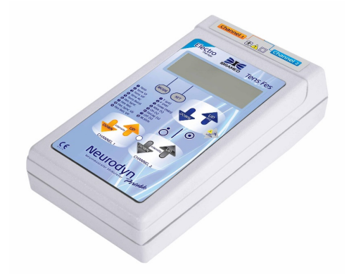
Current MyoStim ED ErectiStim portable device design